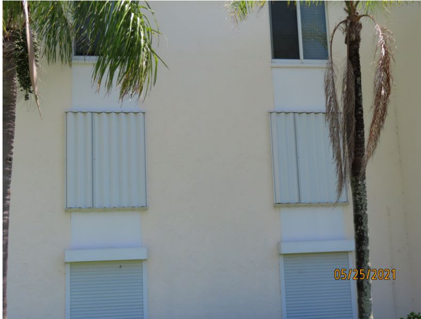
Non-Impact Rated Accordion Shutter