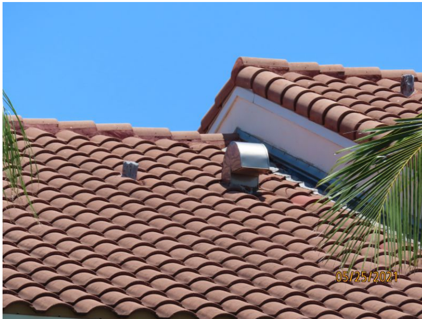
Concrete/Clay Tile Roof Covering