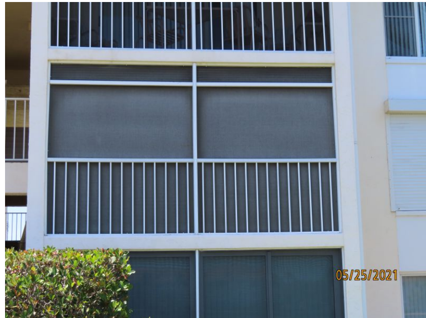
Non-Impact Rated Roll Down Shutter