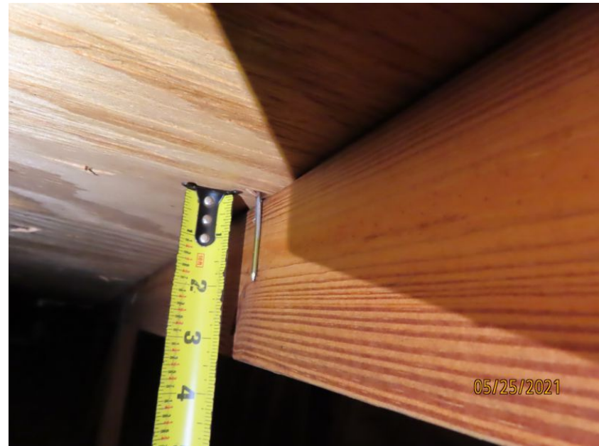
8d Nails or Greater in Size