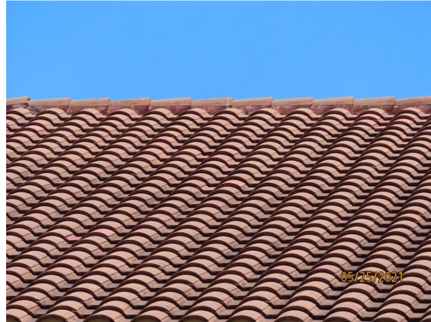
Concrete/Clay Tile Roof Covering