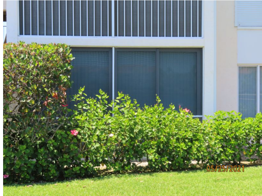
Unverified Impact Rated Glazed Door