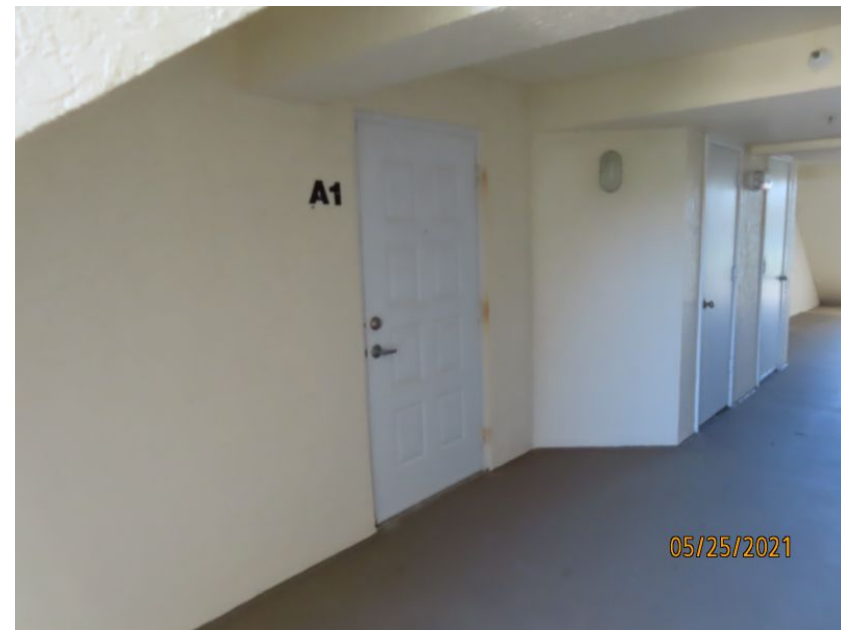
Unprotected Solid Entry Door