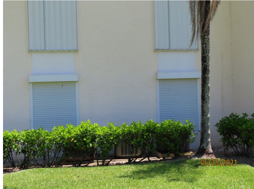
Non-Impact Rated Roll Down Shutter