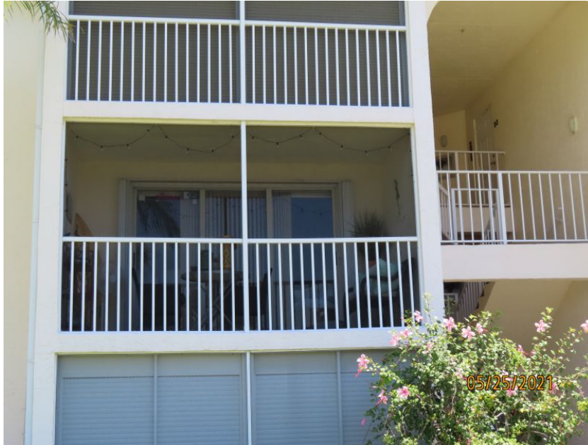
Non-Impact Rated Accordion Shutter